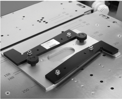
Jig for trapezoidal samples, 76-PV47020