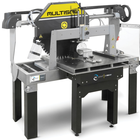
Cutting machine MULTISAW sawing asphalt slab by included holder