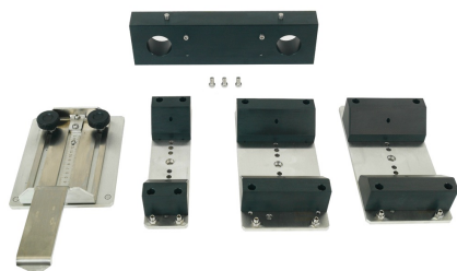
Detail of core holder accessory 76-PV47014